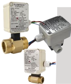
MODEL FFS - SKS | ABS Enclosure to IP-66 | With brass body & flow indicator Versatile | Durable | Turbine Type | Industrial use