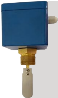
MODEL FFS - KMS | ABS Enclosure IP-65 Durable | Vane Type | Easy to use | Industrial Flow Switch