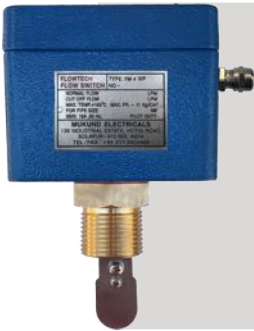
MODEL FM4 - WP | Pressure Die-cast Aluminium Enclosure IP-66 Factory calibrated | Durable | Vane Type | Industrial Flow Switch