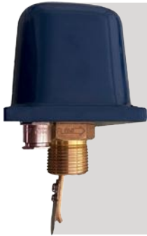
MODEL FM4 - GP | Polycarbonate Enclosure IP-65 Factory calibrated | Durable | Vane Type | Industrial Flow Switch